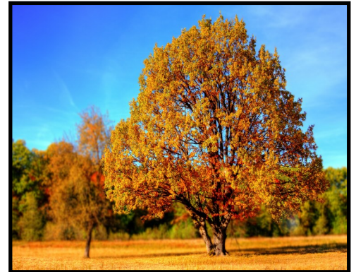
The beauty of Fall