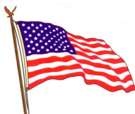
Flag Day—June 14th

We at Word of Life Lutheran have depended on the Lord to sustain us through these 9 years. The Lord is our refuge and into His hands we have committed our lives to Him in worship and adoration.